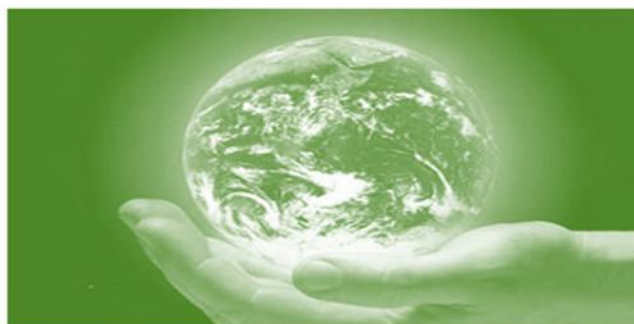
Fig: 2.3: sustainable development

Developing countries such as India and China did not have to commit to reductions during the period 2008-2012 because their per capita emissions were much lower than those of developed countries and because their economies could not easily cope with the cost of switching to cleaner fuels. However, developing countries will be expected to play more active roles in the fight against global warming in the future as these countries become more industrialized and new, more affordable and efficient energy technologies are created.