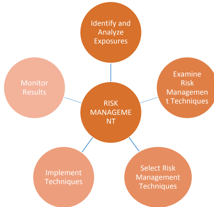
Fig : 12.1

Generally people think that simply buying insurance is managing their risk. However, insurance is not the only method of dealing with risk. Other, often cheaper options are available for different circumstances.