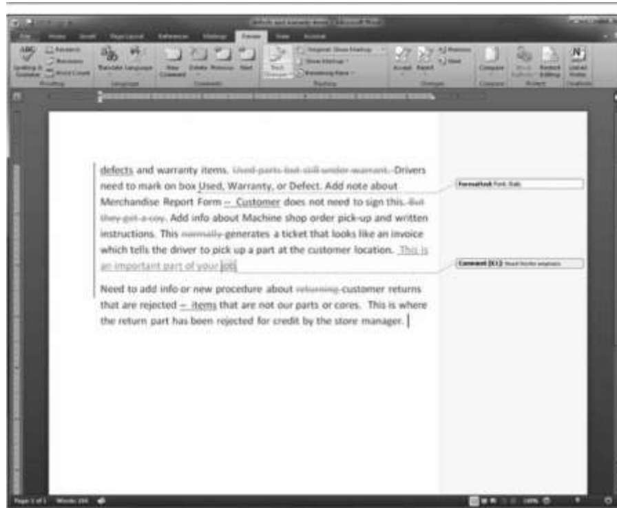
FIGURE 9.2 Revisions in a Microsoft Word Document

person's changes. After you have reviewed the revisions, you can accept them or reject them, either one at a time or all at once.