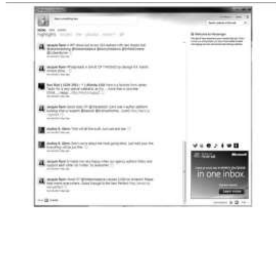
FIGURE 8.18 Windows Live Messenger.

information that appears at the top of the message. Verify that you sent the message to the proper address. If the problem persists, notify your ISP or the person you're trying to send mail to.