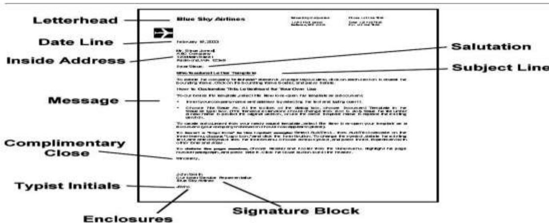
FIGURE 8.1 Parts of a Business Letter