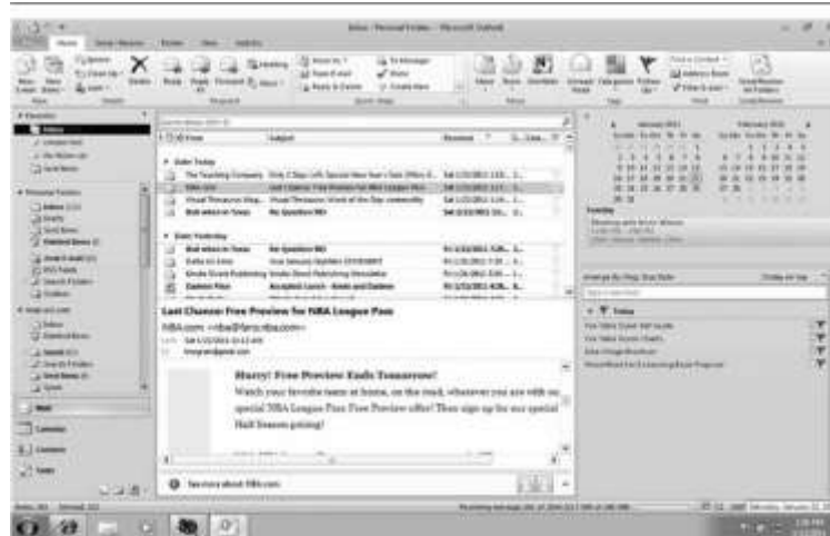
FIGURE 8.14 Microsoft Outlook

Microsoft Outlook is a more advanced email management program that is included with the Microsoft Office suite of programs. Microsoft Outlook is one of the most common email programs used by businesses today. In addition to sending and receiving email, users can also manage their personal calendar, schedule meetings with coworkers, and manage contacts. Microsoft Outlook can also be integrated with voice-mail systems so that voice messages can be retrieved and played on your computer. Figure 8.14 shows a screen image of Microsoft Outlook.