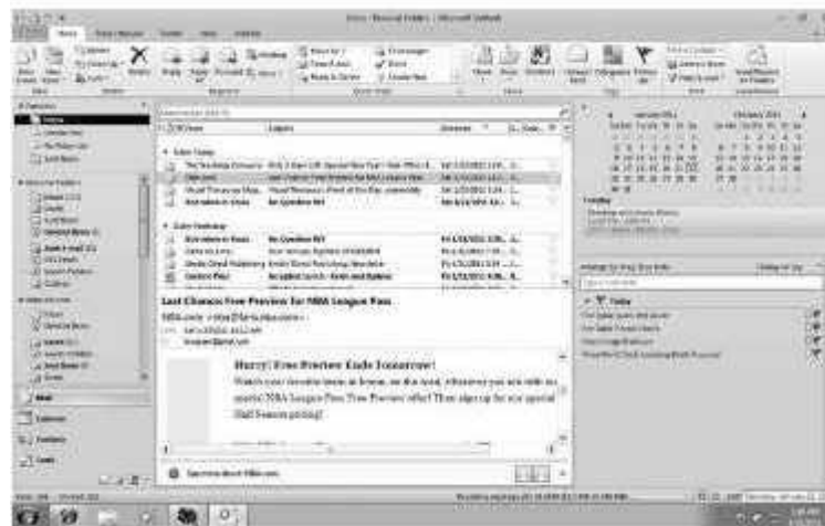
FIGURE 8-14 Microsoft Outlook

Microsoft Outlook is a more advanced email management program that is included with the Microsoft Office suite of programs. Microsoft Outlook is one of the most common email programs used by businesses today. In addition to sending and receiving email, users can also manage their personal calendar, schedule meetings with coworkers, and manage contacts. Microsoft Outlook can also be integrated with voice-mail systems so that voice messages can be retrieved and played on your computer. Figure 8-14 shows a screen image of Microsoft Outlook.