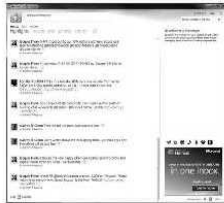
FIGURE 8-18 Windows Live Messenger.

information that appears at the top of the message. Verify that you sent the message to the proper address. If the problem persists, notify your ISP or the person you're trying to send mail to.