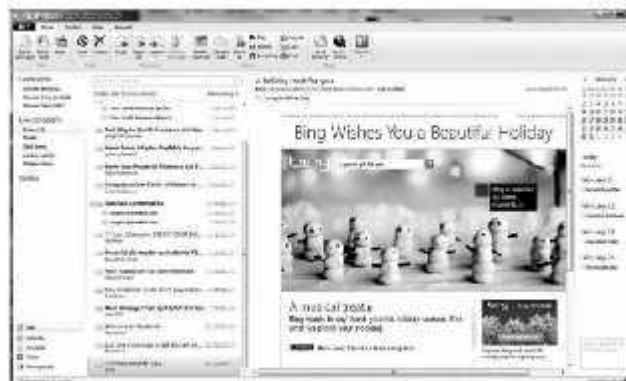
FIGURE 8-15 Windows Live Mail

IBM's LotusLive Suite is an email messaging and collaboration program that includes email, a schedule, a To-Do list, a calendar, an address book, a personal journal, Web pages, and databases. LotusLive Suite can be integrated with voice mail, pagers, fax, and wireless devices such as cellular telephones and smart phones. Figure 8-16 shows a screen image of LotusLive Suite.