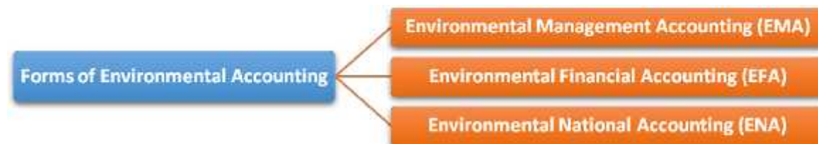
Fig. 4.4: forms of environmental accounting

There are three basic branches of environmental accounting, as shown in the diagram below.