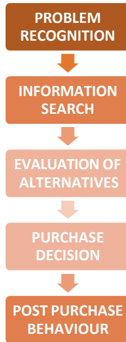
Figure 5.4 Stages in a Buying Process

The following steps are involved in the decision making process of a consumer when considering a purchase: