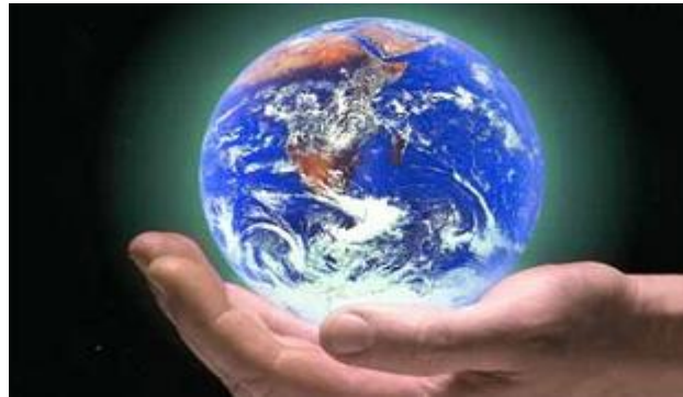
Fig: 2.3: sustainable development

Developing countries such as India and China did not have to commit to reductions during the period 2008-2012 because their per capita emissions were much lower than those of developed countries and because their economies could not easily cope with the cost of switching to cleaner fuels. However, developing countries will be expected to play more active roles in the fight against global warming in the future as these countries become more industrialized and new, more affordable and efficient energy technologies are created.