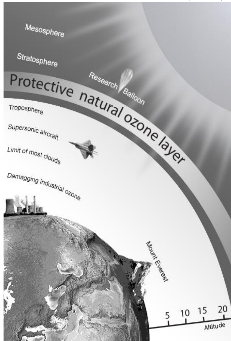
Fig: 2.1: the ozone layer

Earth's atmosphere is divided into three regions: the troposphere , the stratosphere , and the mesosphere . The stratosphere extends up to 10 to 50 kilometres above Earth's surface. This region contains a pungent, bluish gas concentrated in what is known as the ozone layer . Ozone gas is made up of molecules which are each made up of three atoms of oxygen. Thus, its chemical formula is O 3 . The ozone layer acts as a filter which blocks out harmful solar ultraviolet B, or UVB, rays.