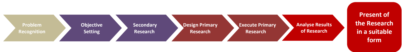
Fig 5.2: The Market Research Process

Usually, it is recommended to begin Market Research using secondary sources. It proves to be beneficial in a number of ways. The costs are cheaper and it is much quicker. Sometimes, you might even find the exact information that you needed, so no research of your own is required. And even if you find incomplete information, you will only have to fill in the gaps with primary research of your own; which is indeed much easier, time saving and cheaper than conducting the entire researches yourself.